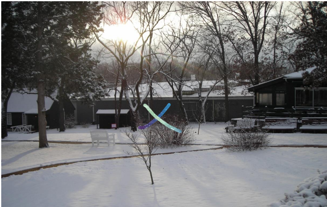
Future Site of the New Rustic Learning/Event Center - in between the Library and The Barn (shed already dismantled)